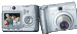
Digital Still Camera • Menu/Function Selection