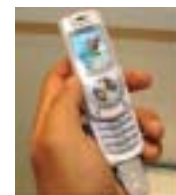
Mobile • Menu/Function Selection