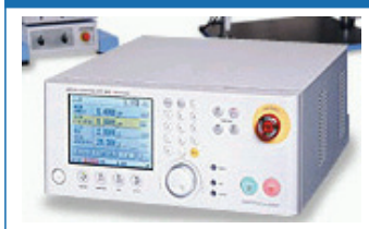
• Measuring Device