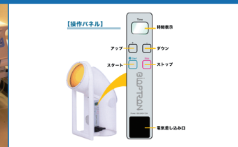
• Facial equipment using supersonic waves